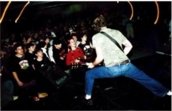
The Separation Suicide playing at L'Anti in Quebec City. Date and photographer unknown