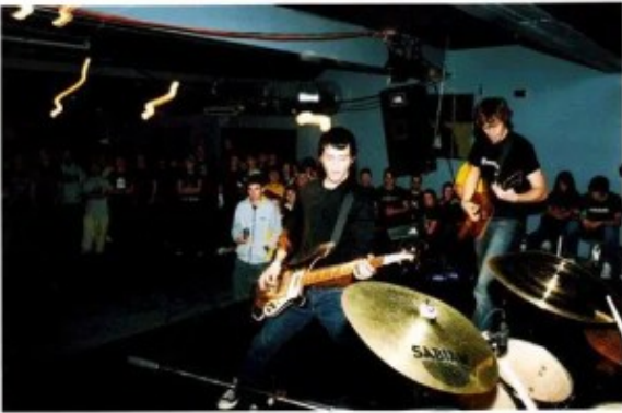
The Separation Suicide playing at L'Anti in Quebec City. Date and photographer unknown