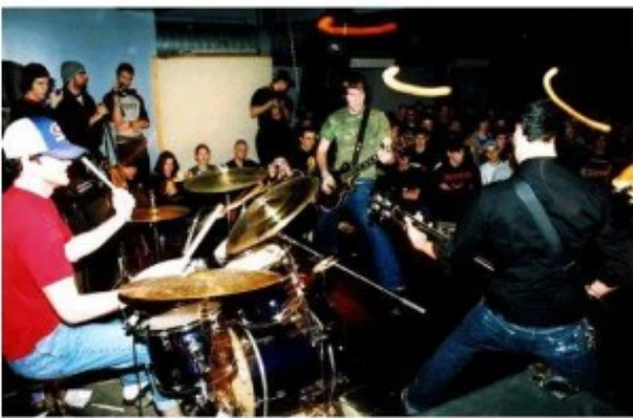
The Separation Suicide playing at L'Anti in Quebec City. Date and photographer unknown