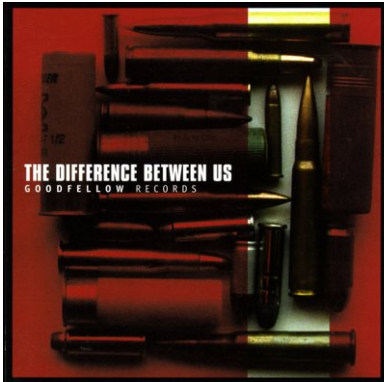
"The Difference Between Us" compilation. Goodfellow Records, 1997.

Through out 1997 they continued to write material and play festivals, and were talking about recording another full-length, including the newly written songs "EastEnd" and "Owned and Operated". They never got to record any of the new material in studio however, and played their final show on October 10th 1997 at Call the Office in their home town (it was their 65th show) with Holocron (the band they played with the most), Acceptance and Slipshod.