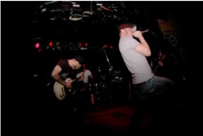
Raise Them and Eat Them, live in early 2005