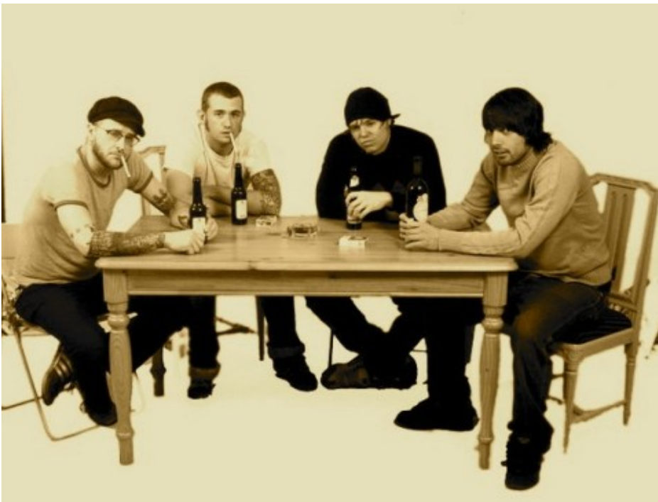
Raise Them and Eat Them promotional band picture, circa 2005

New promotional photos were taken of the band and in October they sat down with Wavelength for an interview. In this interview, Raise Them and Eat Them mentioned that their self-titled, nine-song album, was ready and set to be released in mid-November. The interview would be published a month later, however the album would not. I wasn't able to find out why the