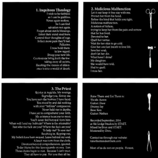
“Raise Them and Eat Them” EP, CD album cover, September 2004.

In late August, the five-piece band announced that they were ready to record four songs for their debut release. However only three songs would be tracked in September, once again at their home studio but this time with a little help from ex-Katja guitarist, Evan Rautiainen. In late September, their