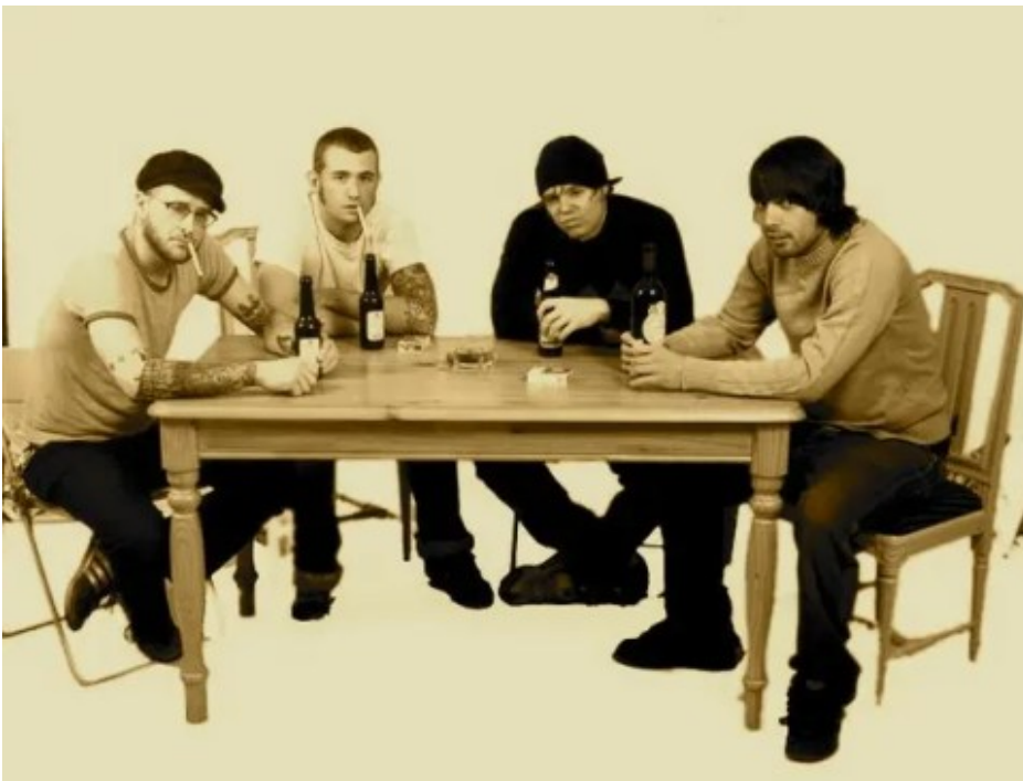
Raise Them and Eat Them promotional band picture, circa 2005

New promotional photos were taken of the band and in October they sat down with Wavelength for an interview. In this interview, Raise Them and Eat Them mentioned that their self-titled, nine-song album, was ready and set to be released in mid-November. The interview would be published a month later, however the album would not. I wasn't able to find out why the