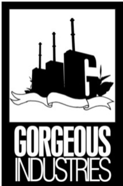
Gorgeous Industries logo