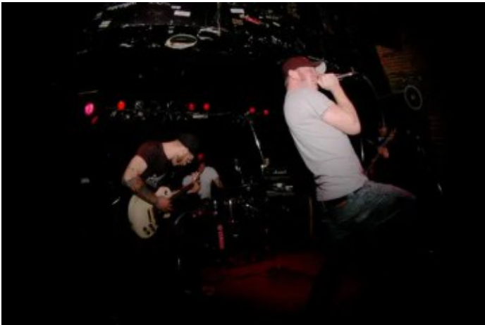
Raise Them and Eat Them, live in early 2005