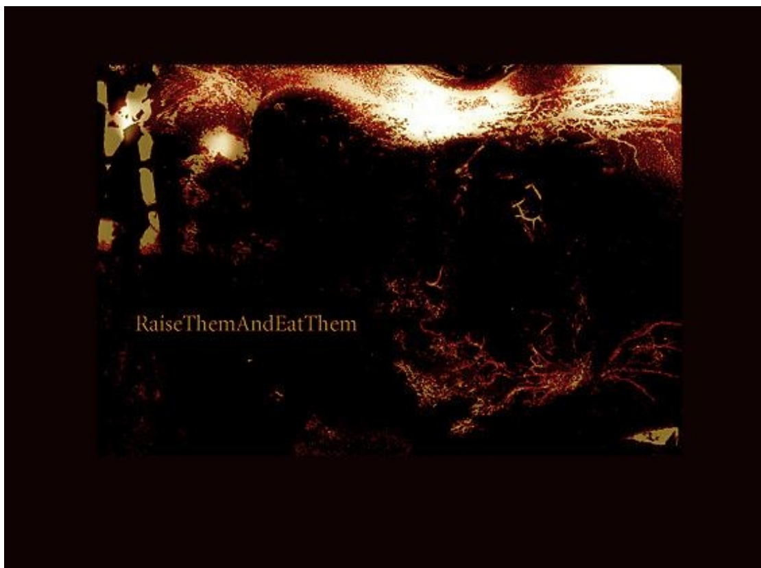
Image used for "Chapter #1: The Omnipotent Failure", prior to having any band pictures.