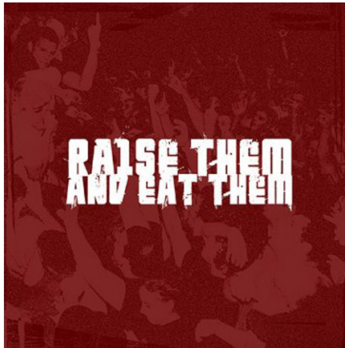
"Raise Them and Eat Them" EP, digital album cover, September 2004