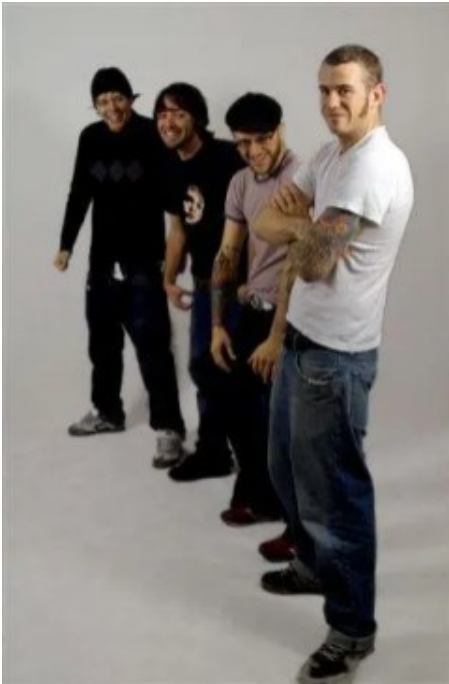
Raise Them and Eat Them promotional band picture, circa 2005