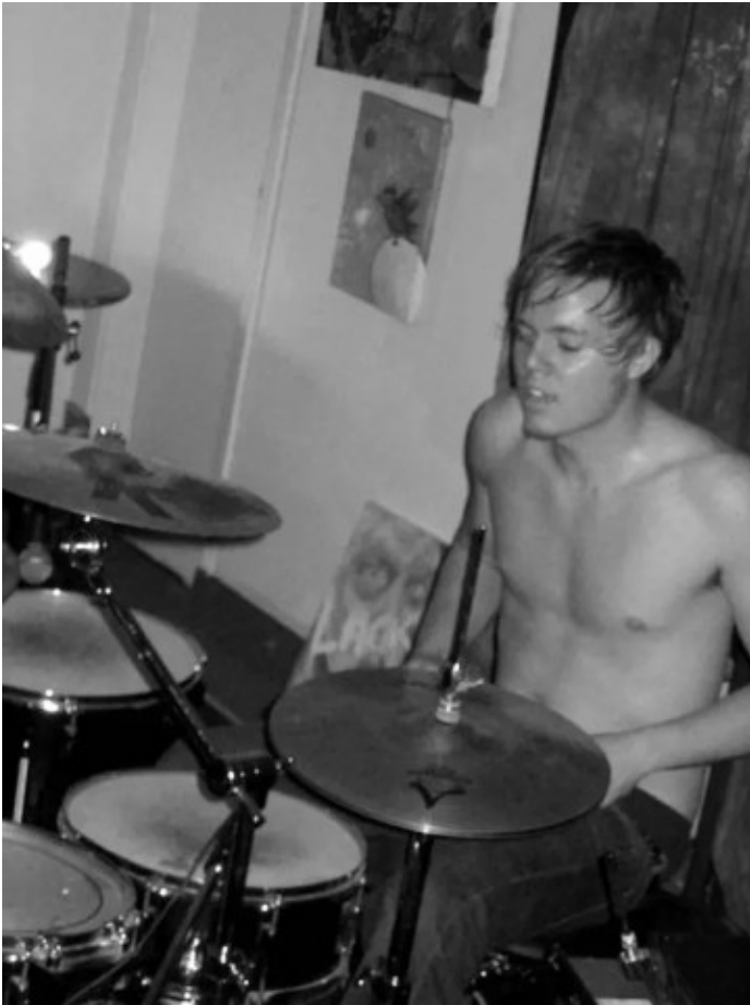
Raise Them and Eat Them at Cafe Aquarius, Guelph, Ontario, October 9th 2004.