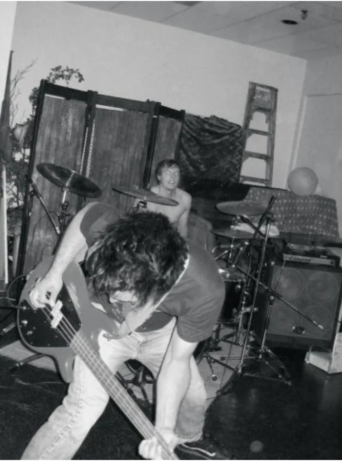
Raise Them and Eat Them at Cafe Aquarius, Guelph, Ontario, October 9th 2004.