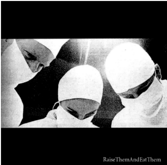
“Raise Them and Eat Them” EP, CD album cover, September 2004.