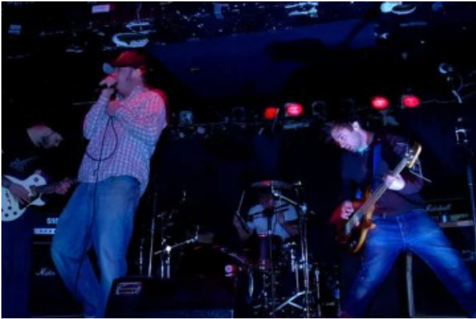
Raise Them and Eat Them, live in early 2005

first full-length which was planned to be released in the summer of 2005, with no label backing as of yet.