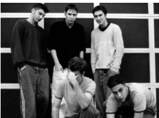
Louis Mistreated's second photoshoot, 2001