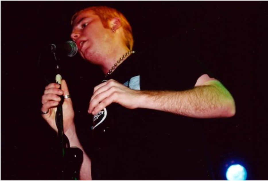
Louis Mistreated performing at the Horseshoe Tavern on January 23rd 2002, opening for The Gloria Record