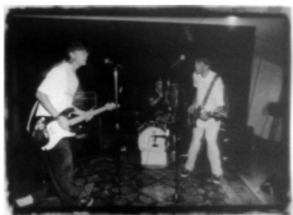
Kenobi