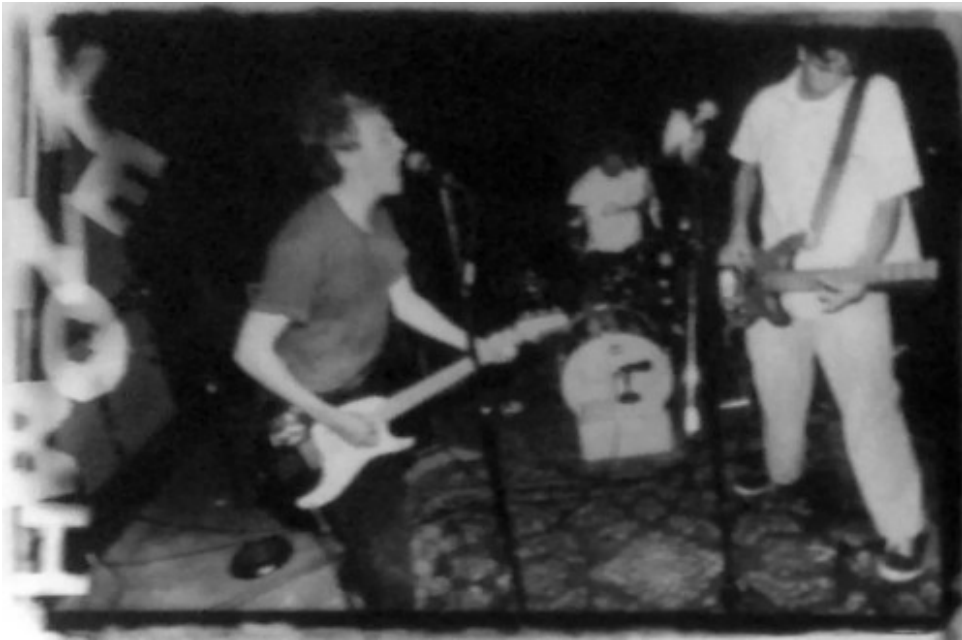
Kenobi