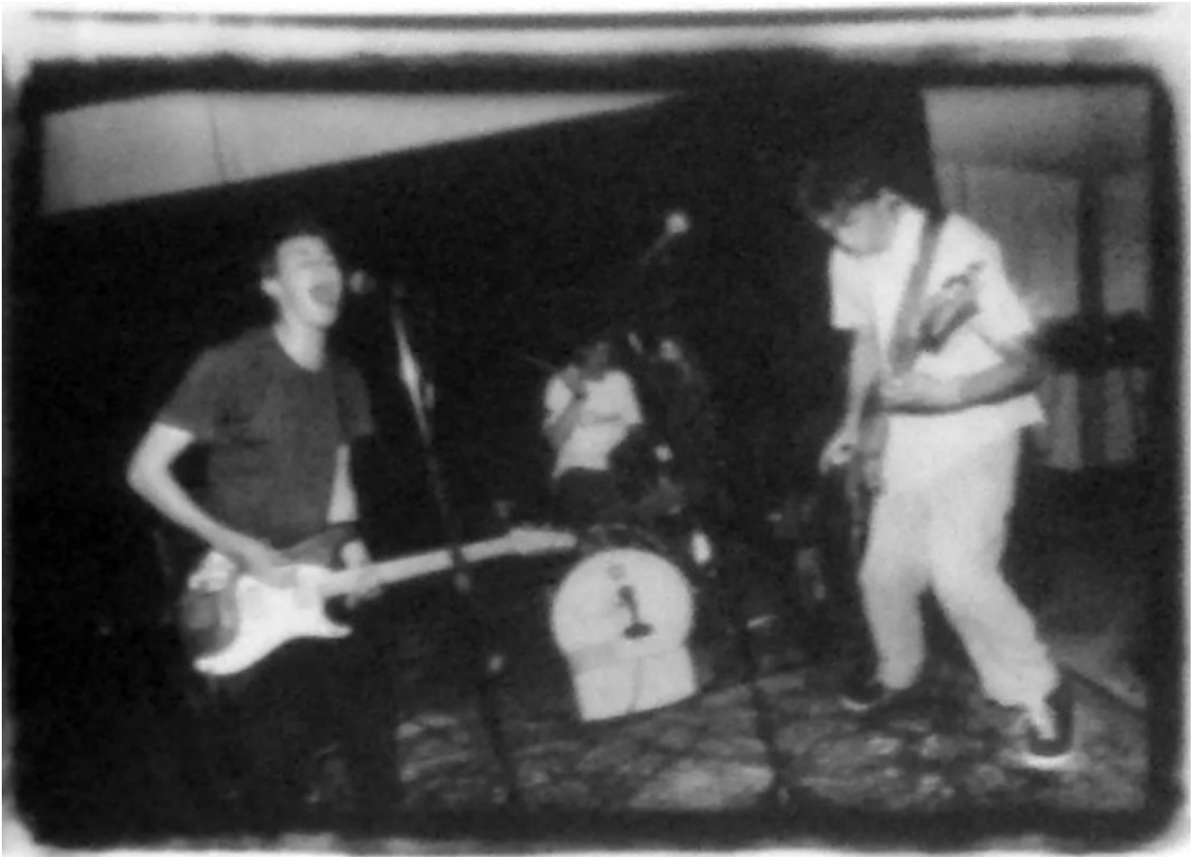
Kenobi