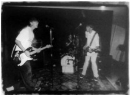
Kenobi