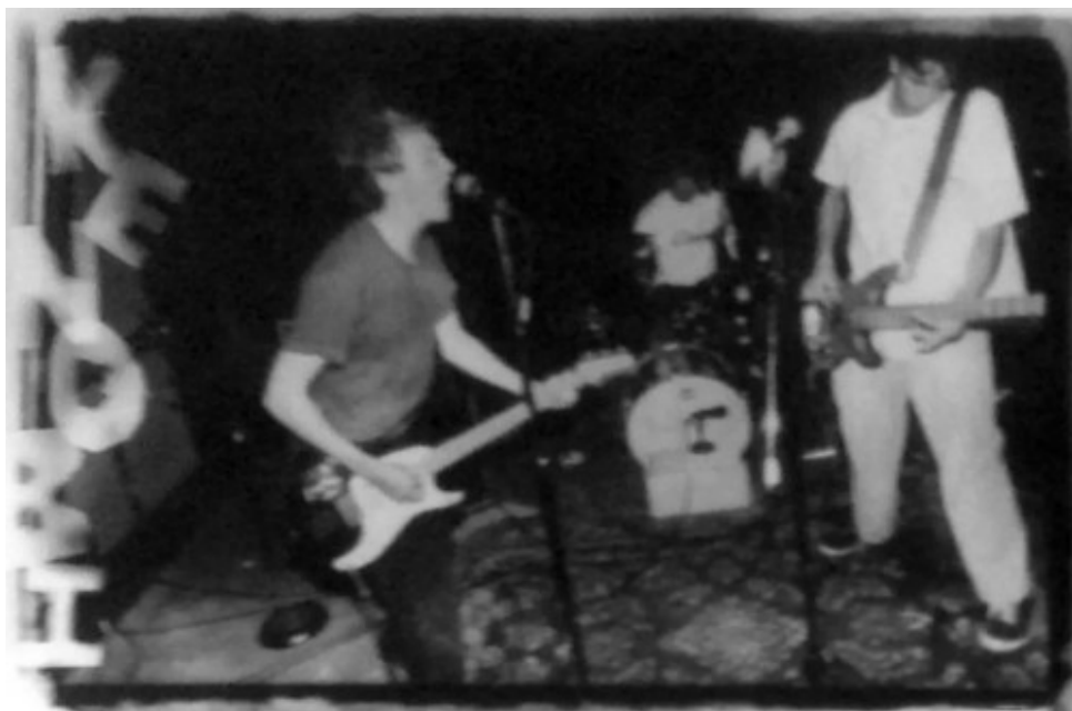
Kenobi