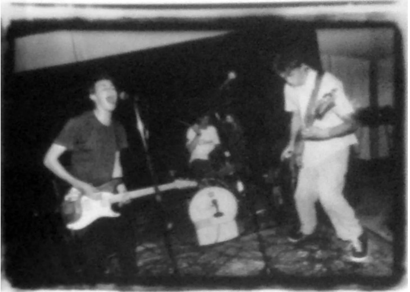
Kenobi