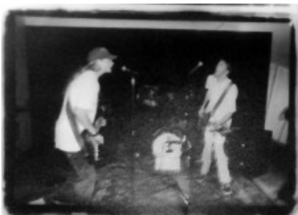
Kenobi