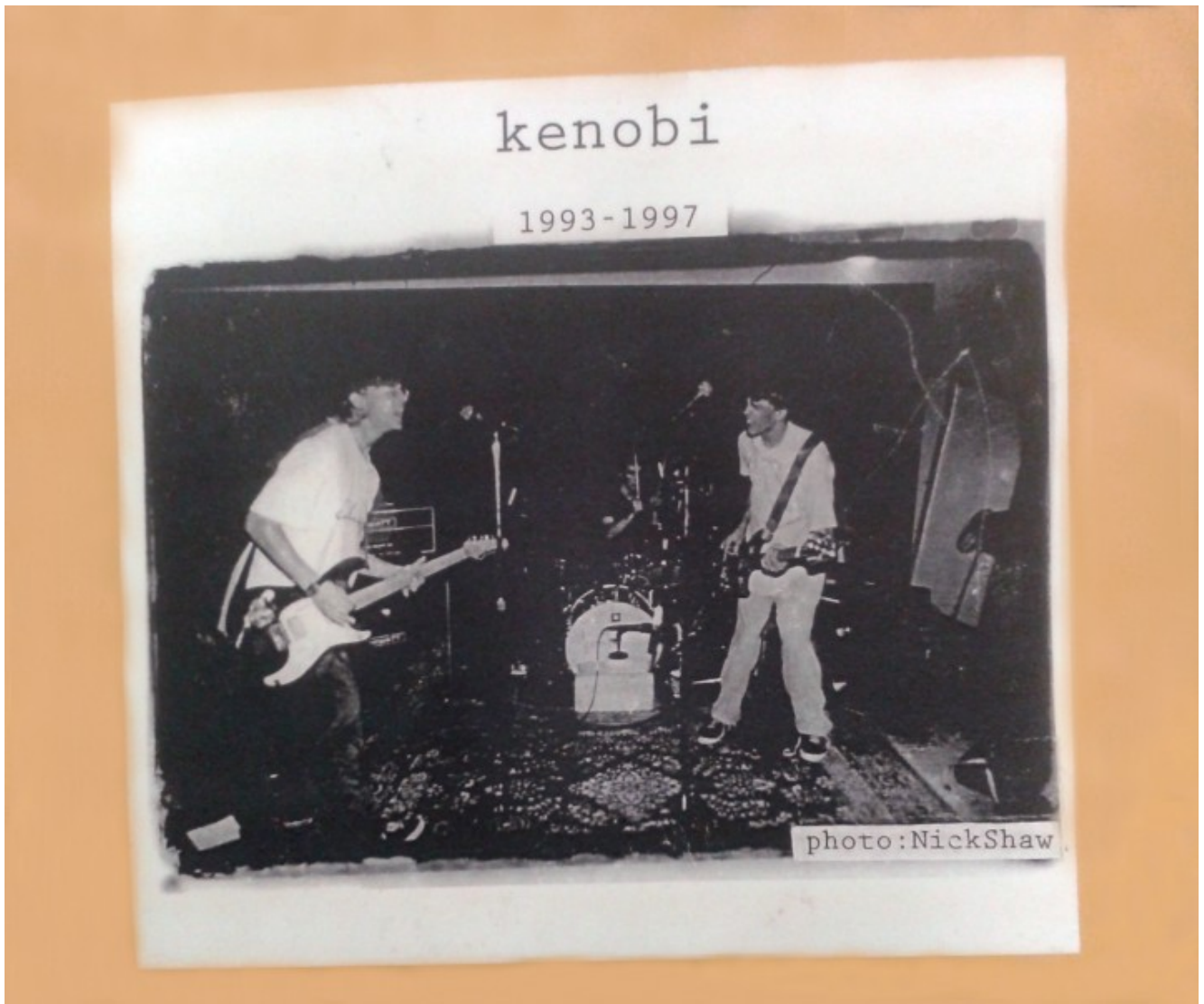
The 2002 CD "Kenobi (1993-1997)" in its manila envelope package form