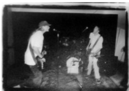
Kenobi