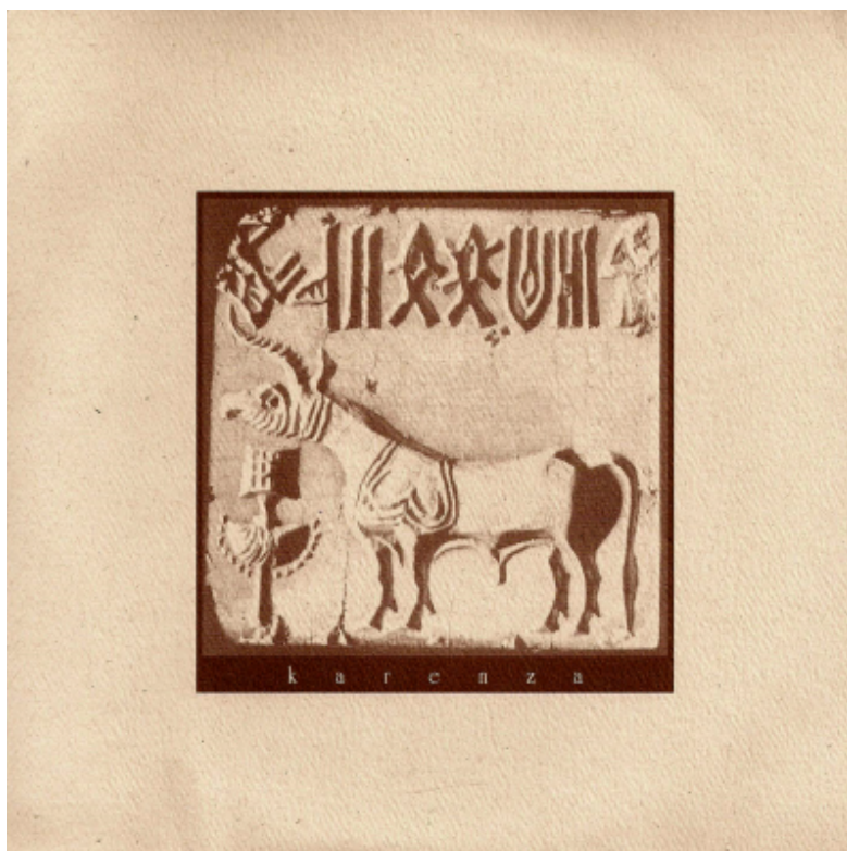
Karenza 7", (Rosepetal of) Sun and Moon Records