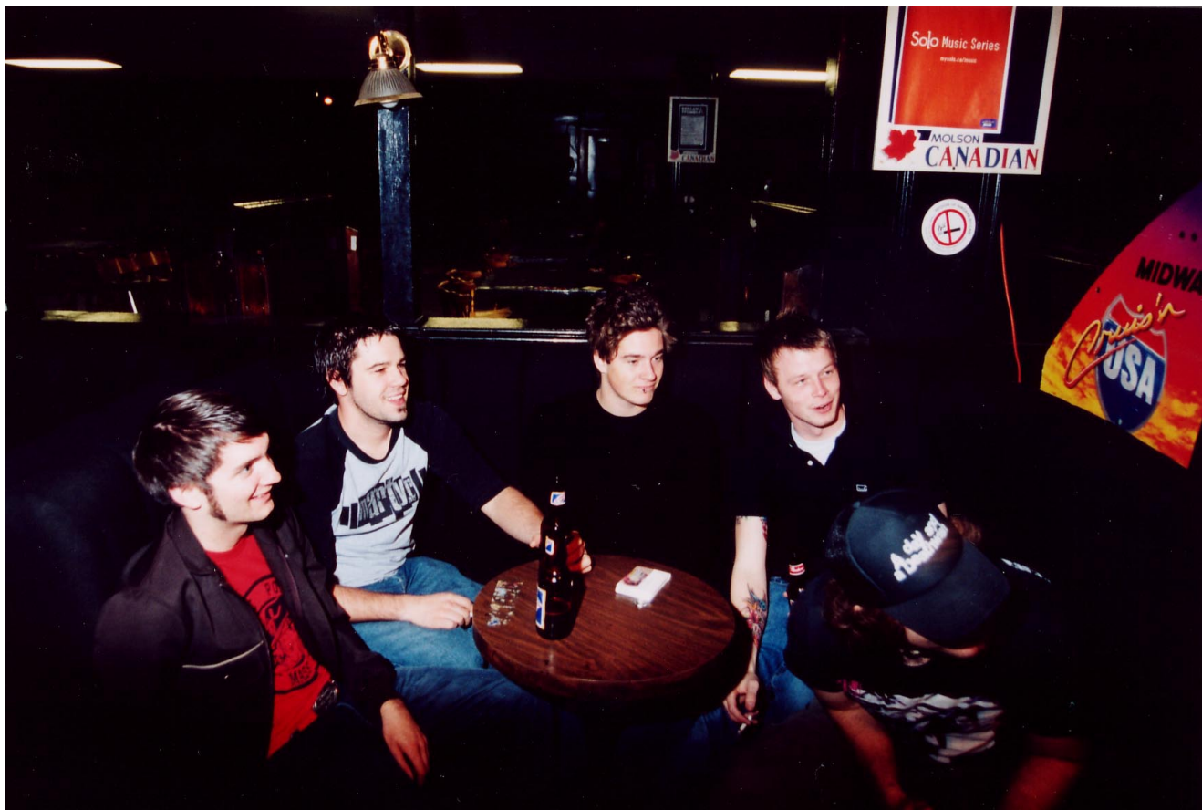
Jude the Obscure, circa 2003