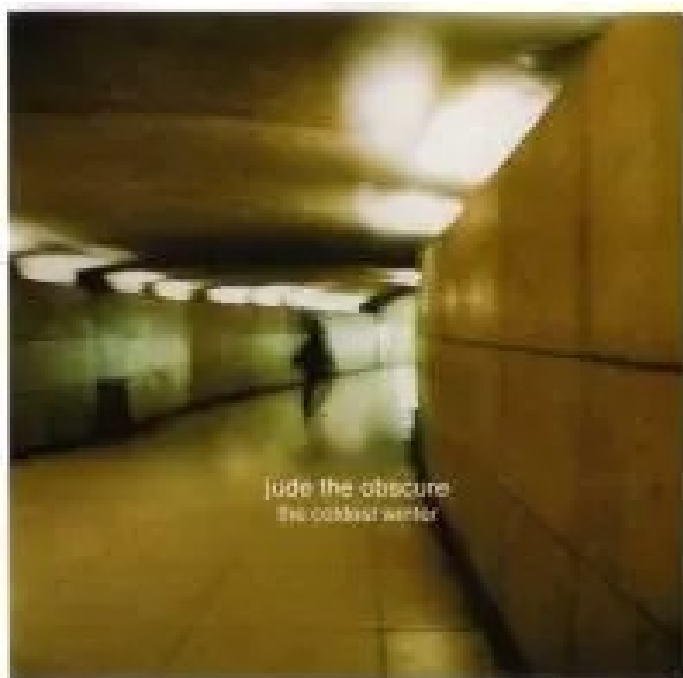
“The Coldest Winter”, October 2003, Defiance Records