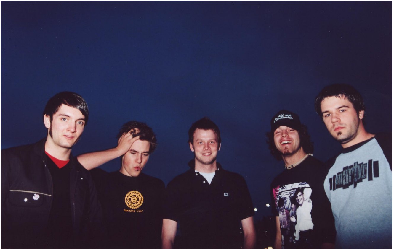
Jude the Obscure, circa 2003