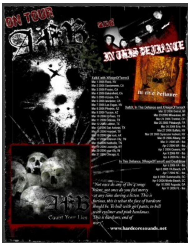
In This Defiance's third tour, with Armed for Battle,