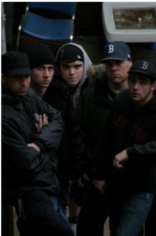
In This Defiance, circa spring 2006.