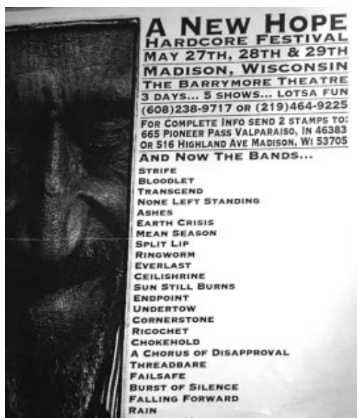
A New Hope Hardcore Festival, Madison, Wisconsin. May 27th – 29th 1994.