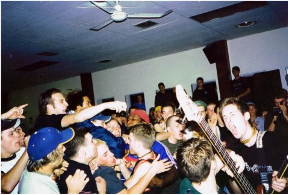
Confine playing in Oakville.