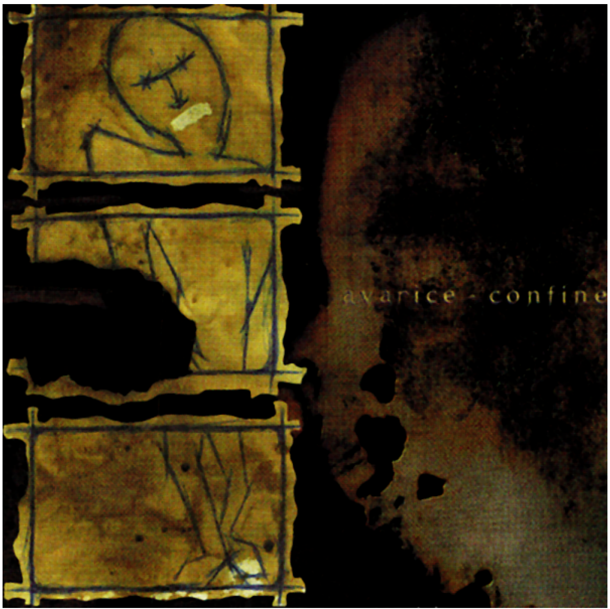
Avarice and Confine split, Redstar Records, summer 1998