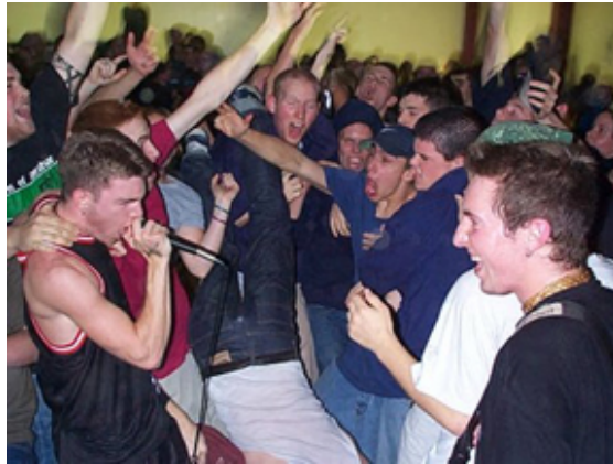
Confine playing live