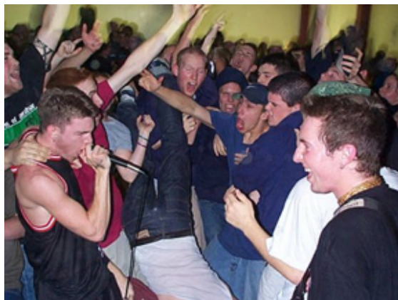
Confine playing live