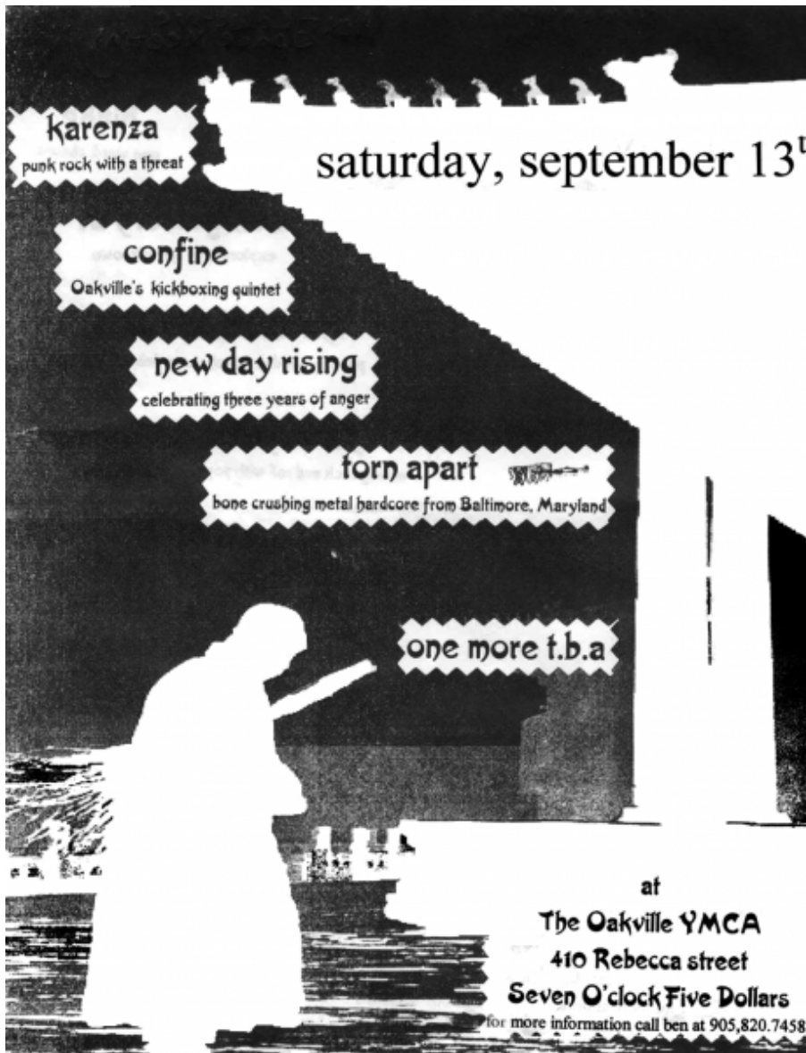
Confine show on September 13th 1997 at the Oakville YMCA with Karenza, New Day Rising and Torn Apart