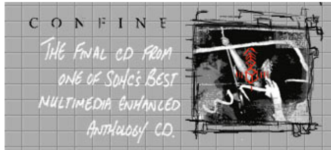
Re-Define Records ad for the Confine discography, circa 2001