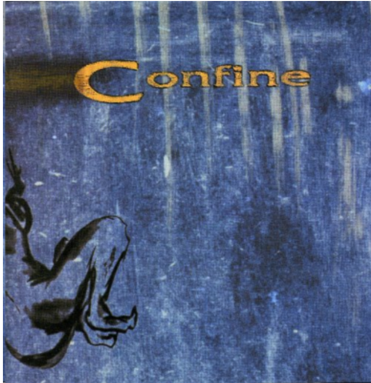
Confine "The Beginning of the End", OneDaySavior Records, July 16th 1999