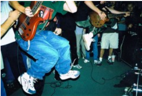
Confine playing in Oakville.