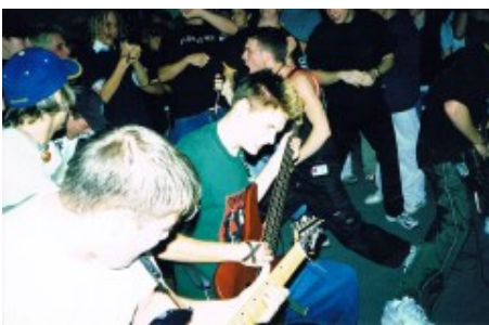
Confine playing in Oakville.