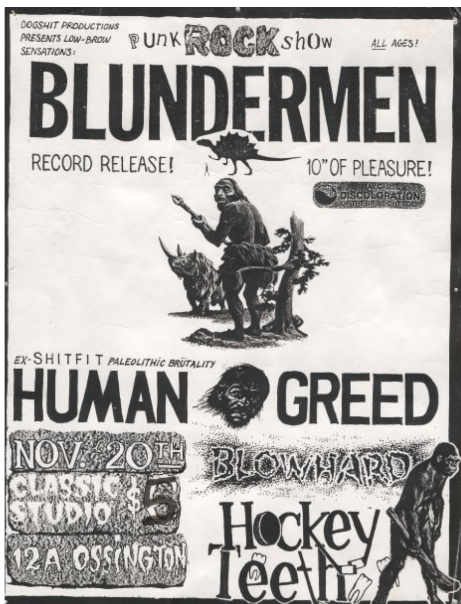
"Blunder on Bikini Island" release show on November 20th 1993.

while the tape edition added their cover of 4 Skin's "Chaos". This mentioned cover would also be included on a later Fans of Bad Productions Records compilation, "GO!", which was released in 1997 on vinyl and 1998 on CD. The version of "Chaos" on "GO!" somehow got slowed down during the mastering process for the compilation (apparently Eva from Wad said their song had the same problem). But the version on the tape version of "Blunder on Bikini Island" remains at the correct speed.