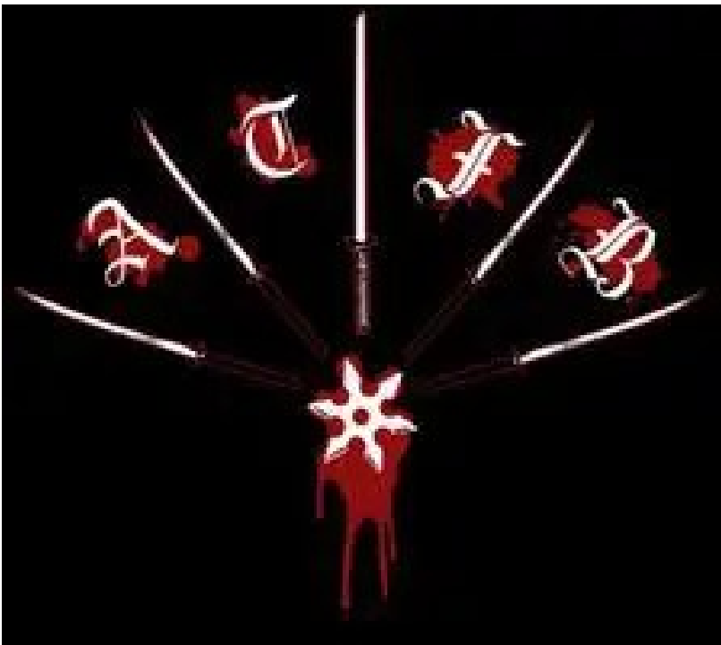
A Taste for Blood logo during the promo 2004 era.